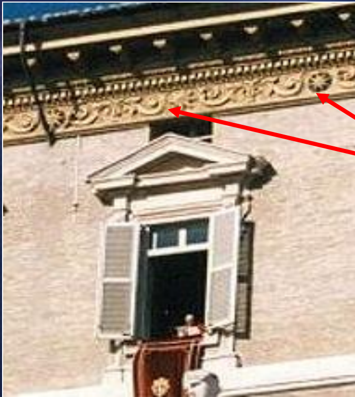
Nimrod's Sunburst on Papal Living Quarters