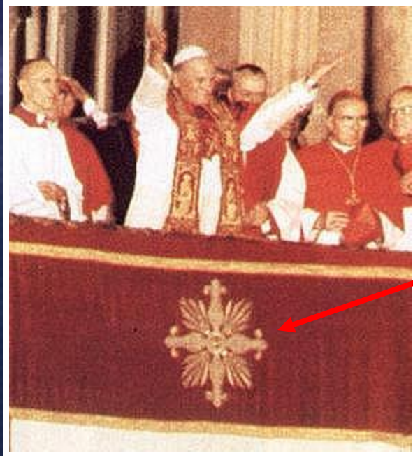
Nimrod's Sunburst on Papal Banner