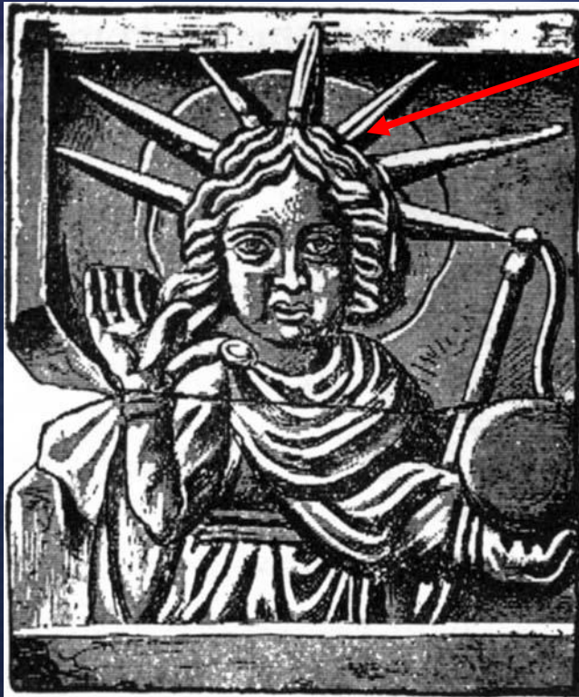
Mithra of Rome