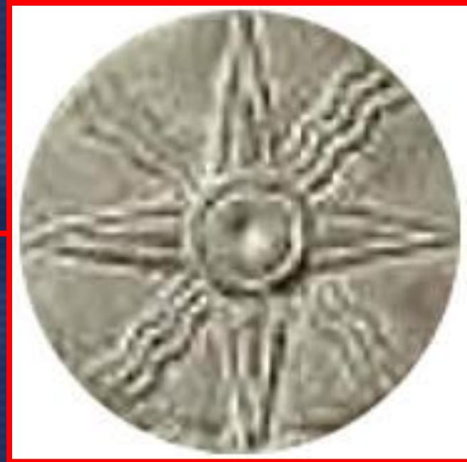
Nimrod's Eight-Spoked Sunburst on the Babylonian Altar of King Shamash