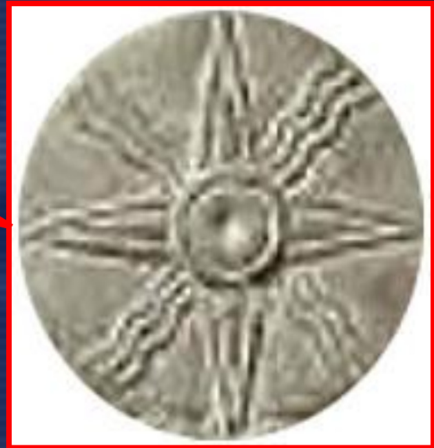
Nimrod's Eight-Spoked Sunburst on the Babylonian Altar of King Shamash