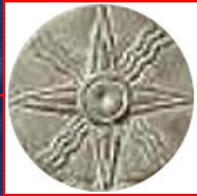
Nimrod's Eight-Spoked Sunburst on the Babylonian Altar of King Shamash