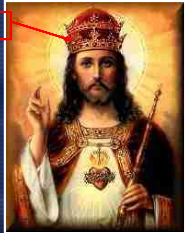
Roman Catholic Christ