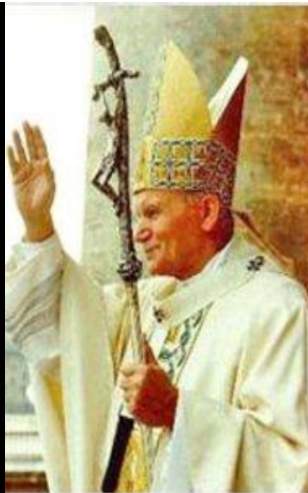
The Religious "Mitre" Hat From Babylon