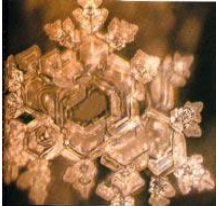
Bach's "Air on the G String"